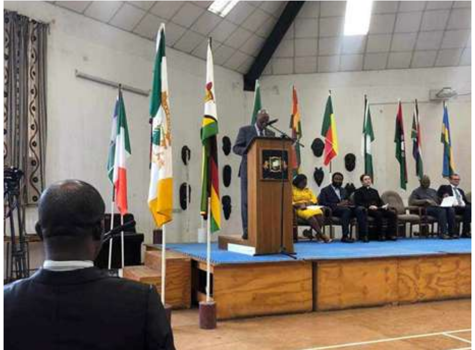
The international conventional had over 28 nations in attendance

AJUMUN is a model United Nations Annual Conference where students are given tasks before the conference day, various countries to represent. One then researches and writes a position paper on critical issues that are particular to that country but under a broader United