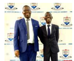
Students got a chance to mix with the University's top hierarchy at the awards.